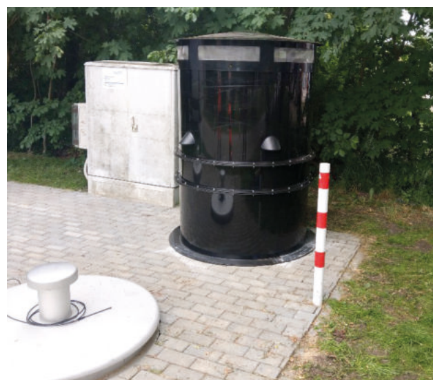
Filter for odor removal from the exhaust air of a sewer shaft

GoSorp® G-X is manufactured as a branded product in one of the most modern production facilities for activated carbon in the world in accordance with high quality standards.