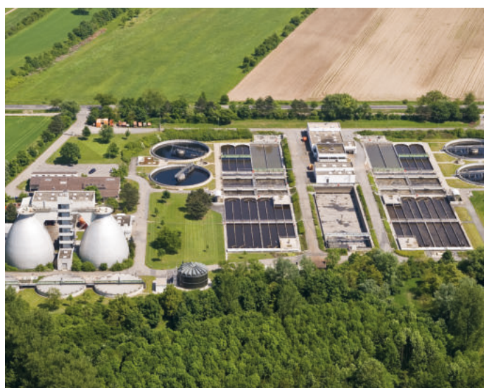
waste water treatment plant

As an impregnating agent, NaOH is currently the best possible compromise between loading capacity and price. GoSorp ® G-S is manufactured as a branded product in one of the most modern production sites for activated carbon in accordance with high quality standards.