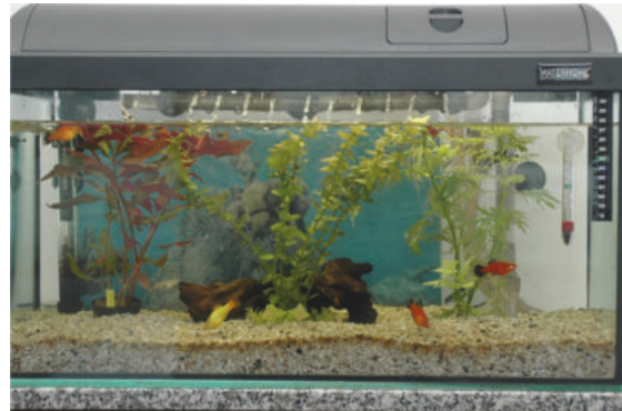
Aquarium with FerroSorp®-filter