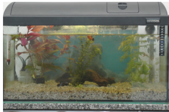
Aquarium without FerroSorp®-filter