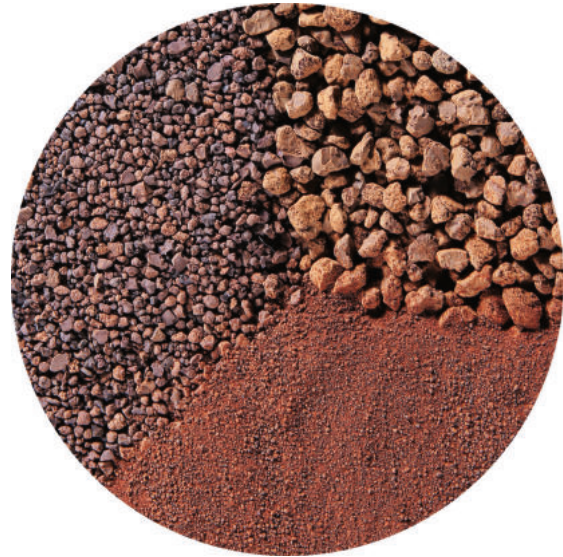
FerroSorp® Plus in different granular sizes

FerroSorp® Plus is on offer in different grain sizes and can therefore be used both in special filter cartridges which operate on the suspension bed filter principle and in filter bags that can be inserted conveniently into any multilayer filter. In addition to phosphates and silicates, FerroSorp® Plus also binds harmful heavy metal ions such as lead, copper and zinc.