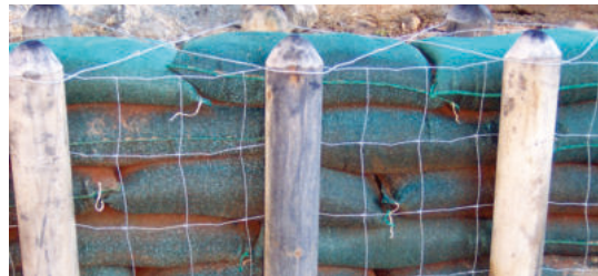
Detailed view of the barrier made of filter bags