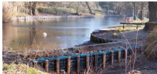
"Nutrient Latch" with Ferrosorp® GW (2 - 4 mm) in filter bags